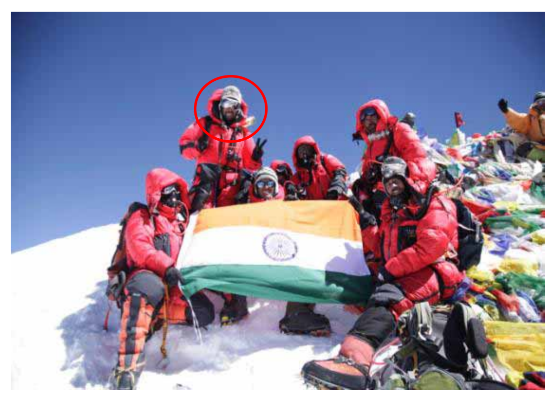
Team On The Top Of The World On 19 May 2013