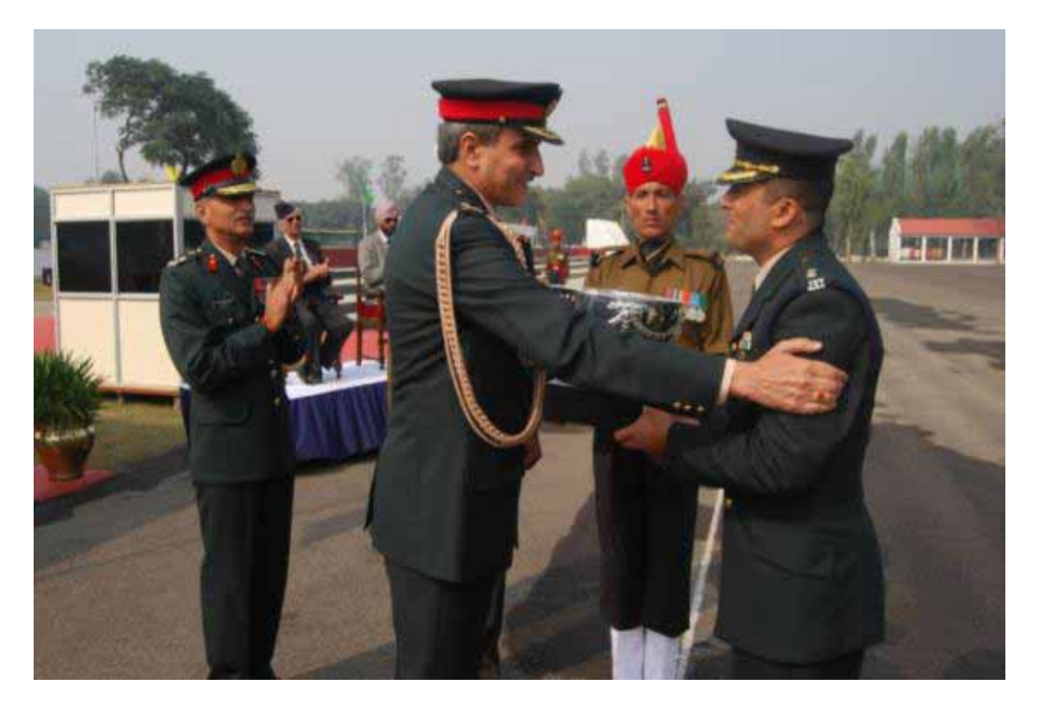
Getting Best Achiever Of JAT Regiment Award From Col Of The Regiment