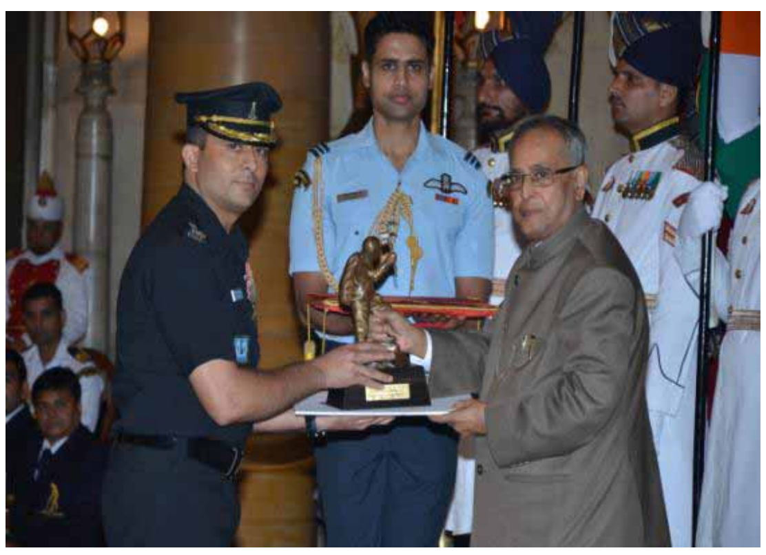
<u>Receiving Tenzing Norgay National Adventure Award</u> <u>from The Hon'ble President Sh Pranab Mukherjee</u>