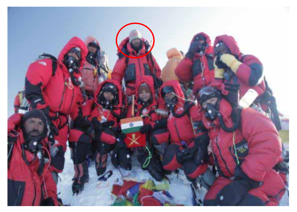
Team 1 On The Top Of The World On 25 May 2012