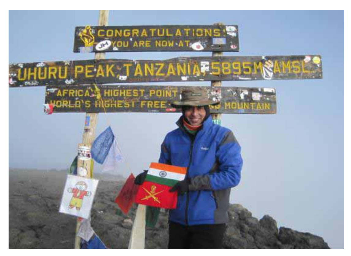
Summit of Mt Killimanjaro, Tanzania (Africa)