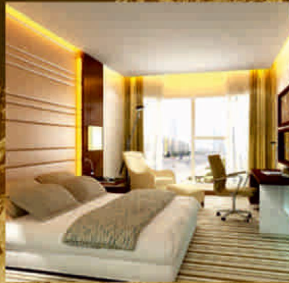
Accommodation and Travel Management