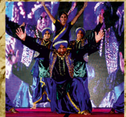
Events and Entertainment