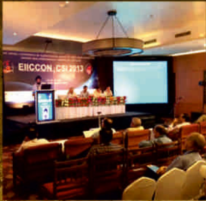
Corporate meeting and Conference Management