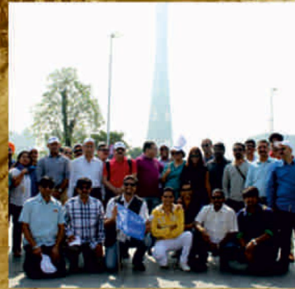
Sightseeing and team building